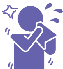
Runny/ stuffy nose